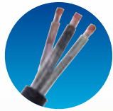
Low-voltage loop rubber cables