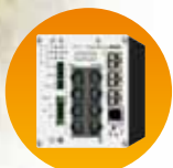
Active switch systems