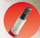
Low-voltage 120° flexible cables