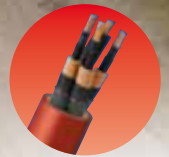
Medium-voltage flexible cables