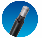
Low-voltage fixed installation cables