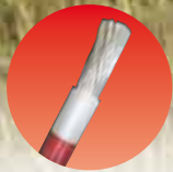
Medium-voltage 180° singlecore cables